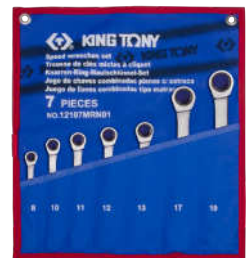
► Teton pouch bag