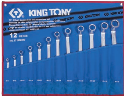
► MRN / SRN : Teton pouch bag