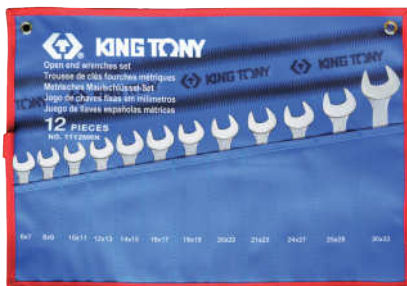
► MRN / SRN : Teton pouch bag