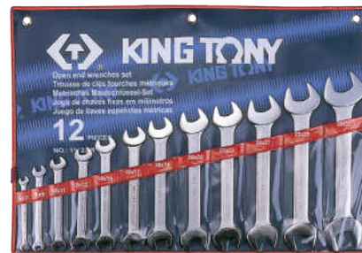
► MR / SR : Nylon pouch bag