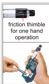
friction thimble for one hand operation