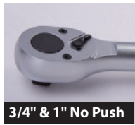
3/4" & 1" No Push